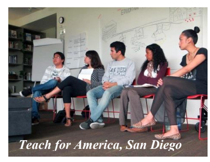
Campus-wide Committee work CCC

Another way the Center engages in outreach efforts is our involvement on campus-wide committees. For 2012-13, the Cross-Cultural Center staff participated in over 300 hours of committee activities to include eleven search committees for campus departments, participation in campus-wide educational awareness programs, and event planning for cultural heritage months. One example of our committee involvement this year was our work with the new Triton Community video project. Staff was involved with other key campus departments in developing an introduction web-based training on diversity and the Principles of Community for all 2013-14 incoming first-year and transfer students. The project set the stage for incoming students about campus climate values and resources to get involved. Staff was also involved in